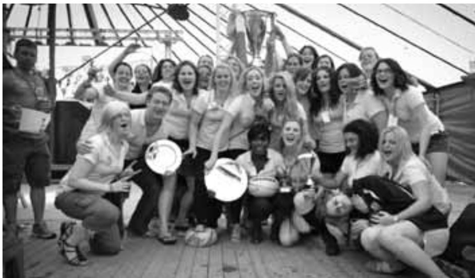
Old Belvedere Players with their haul of trophies from the Flanders Ten's Competition in June 2011

The second nights' entertainment involved a Circus Themed Fancy Dress! Cue the magicians, zebras, candyfloss, canons, tents, strong men, monkeys and mystics!! Of course there were a number of clowns on display....some in costume but some just displaying the effects of a few too many Cherry Beers! The events of the night were definitely ones to remember.....and for those that may want to forget..... one word.....Facebook!!