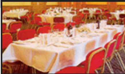
The Terrace Bar