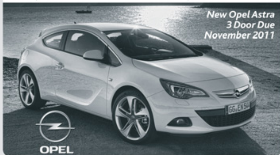
New Opel Astra 3 Door Due November 2011