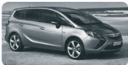
New Opel Zafira Tourer Due November 2011

348 Harold's Cross Road, Dublin 6w. Phone 01 492 3757