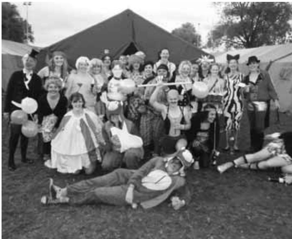
The Old Belvedere players got into the spirit of things as they donned their costumes for the 'Circus' themed fancy dress...seers, clowns, broken monkeys and toppling twins all bound for the big top!