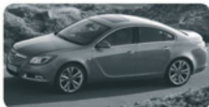
The impressive Opel Insignia for 2012